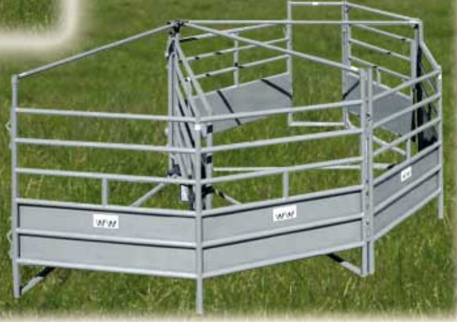
Half Sheeted Tub