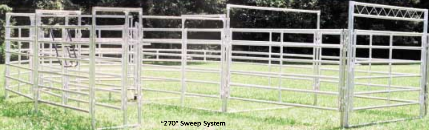
"270" Sweep System

All sweep systems are available with the in-line pre-galvanized flow coat