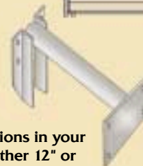
Eave Extensions in your choice of either 12" or 24" lengths

Girt Clips for attaching wood or metal to your Equine Facility